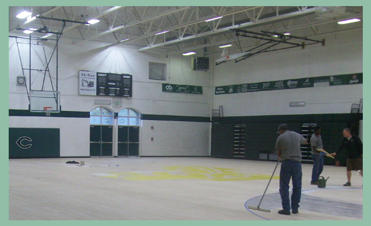
Workers have been diligently renovating the gym for the past several weeks.